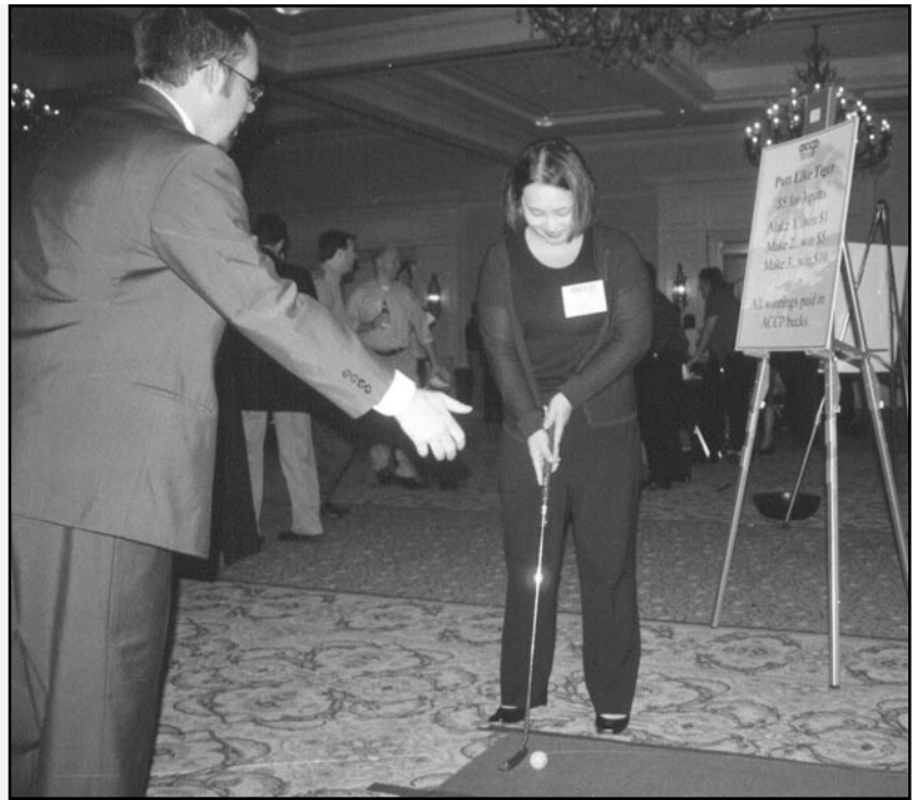
A PRN member helps instruct contestants at the golf game, which was part of the 2001 Silent Auction to benefit the ACCP Research Institute.

For more information about PRN membership, you may e-mail ACCP at accp@accp.com .